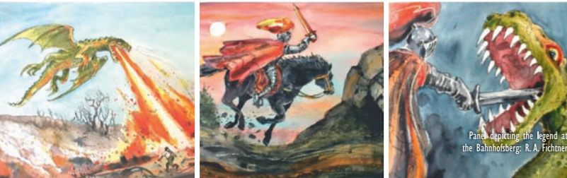
Panel depicting the legend at the Bahnhofsbau

Schwarzenberg was founded around 1150 and has long borne the nickname the "pearl of the Erzgebirge". From its initial settlement in the primeval Erzgebirge forest of Miriquidi, it has flourished over 850 years into a charming small town. There are many legends surrounding Schwarzenberg. Perhaps the best-known concerns the valiant knight George, said to have slain the fearsome lindworm on the Totenstein. Today, knight and dragon are both immortalized in the town's coat of arms. St. George and his fair lady Edelweiß appear at special occasions and festivals as symbols of Schwarzenberg both in the region and beyond.